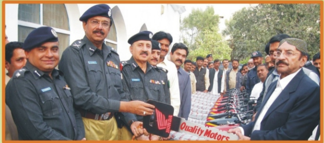
CM Sindh is seen giving key to RPO Sukkur on the behalf of District Government giving 11 motorcycles to District Police costing Rs.01 million