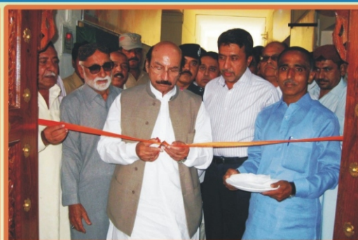
CM Sindh Syed Qaim Ali Shah inaugurates Sachal Yaadgar Committee Office at DCO Office