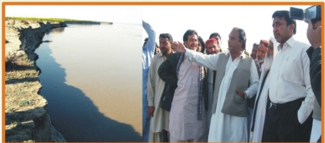
DCO Khairpur & Chief Engineer Sukkur Barrage visits Ubra dyke