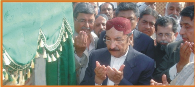
Chief Minister Sindh Syed Qaim Ali Shah Jilani offers Dua after laying foundation stone of Thalassaemia Center and Blood Bank Khairpur