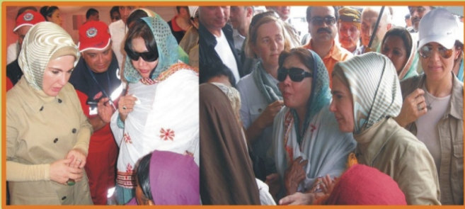
Turkish 1 st Lady Emine Erdogan & MNA Faryal Talpur are seen talking to flood affected women at Turkish Medical Camp at Khairpur