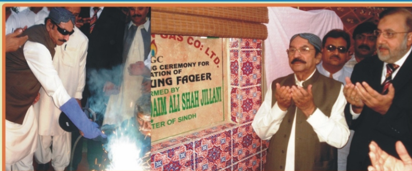
Honorable Sindh Chief Minister Syed Qaim Ali Shah inaugurates Sui Gas supply scheme at Village Loung Faqeer and offers Dua on the occasion