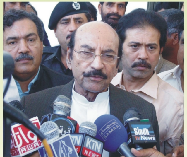
Honorable Sindh Chief Minister Syed Qaim Ali Shah Jillani is seen talking to media at SUKKUR AIRPORT